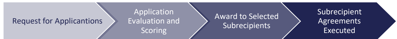
Figure 2: Implementation Process – Service Delivery and Compliance