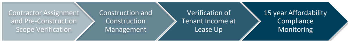
Figure 3: Multifamily Construction and Compliance

The rehabilitation or reconstruction of multifamily rental projects with five or more units will require an affordability period for a minimum of 15 years, as shown in Figure 3: