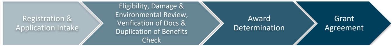
Figure 1: Initial Application and Documentation Steps

The construction and compliance phase, as shown in Figure 2, is when repair, replacement or reconstruction assistance is provided to the landlord property owner through direct construction activities performed by the program and the result is a market-ready affordable housing unit. After the verification of tenant income and the completion of the affordability period for single family rental units, which is a minimum of five years, the grant will be closed assuming the property owner has remained in compliance throughout the term of the affordability period.