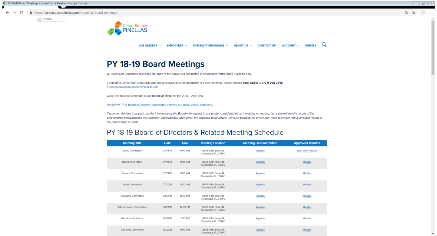
Exhibit 10A. 1