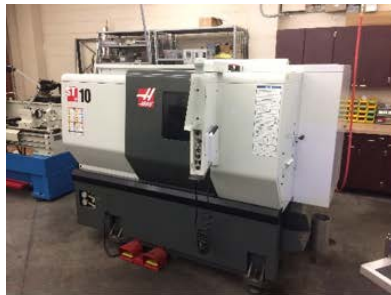
CNC turning center

EIN 4391 (Manufacturing Engineering) and EML 4535C (CAD/CAM). EIN 4391 will provide students with hands-on machining experience as well as fundamental understanding of machining processes such as milling and turning and manufacturing systems such as CNC controls.