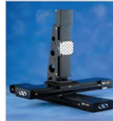
3-axis motorized stage