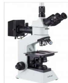
Metallurgical optical microscope