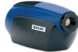
Cameras and detection systems