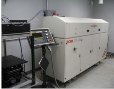
Laser systems for materials processing