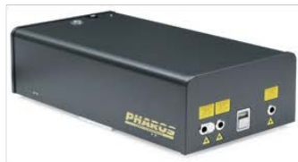
Femtosecond laser for micromachining