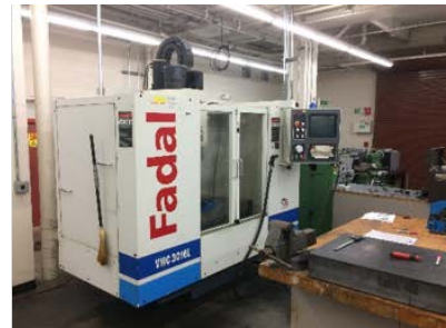
CNC milling center