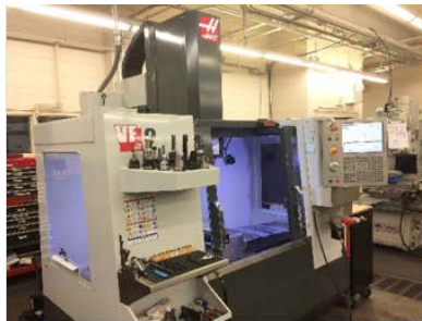
CNC milling center