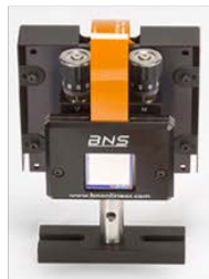
Spatial light modulator