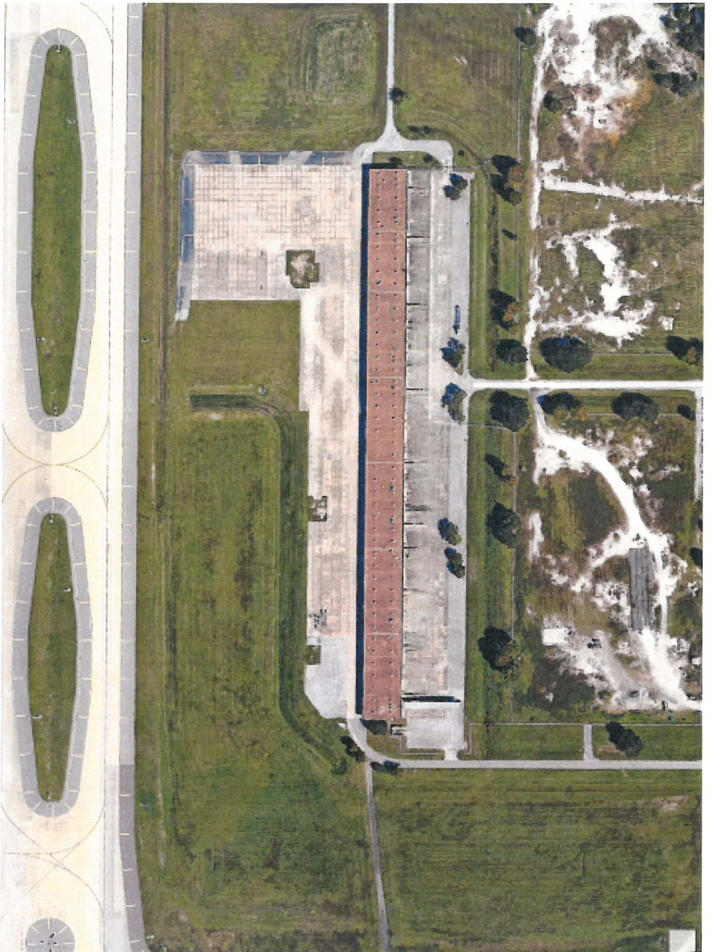
EXISTING NORTH AIR CARGO FACILITY