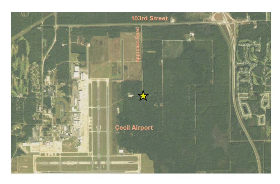
Location of Project

G. Provide a detailed description of, and quantitative evidence demonstrating, how the proposed public infrastructure project will promote Economic Enhancement of a Targeted Industry.