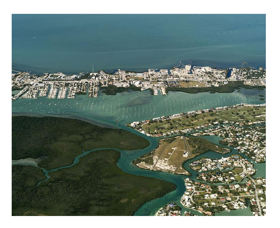
Boot Key Harbor

The City did not meet the projected number of connections of 100% for Sub-Area 3, but was able to complete 36% of the connections.