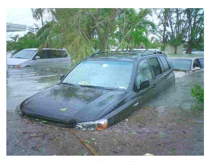
Flooding - Hurricane Wilma

Since 1992, all local governments within the Florida Keys, with the exception of the City of Key Colony Beach, have limited residential growth through an annual cap on new residential development to ensure the ability of the population of the Florida Keys to safely evacuate. The Work Group made recommendations regarding future building permit allocations for each local government. Marathon, Islamorada, and Monroe County have building permit allocations established by Administration Commission rule and within their adopted comprehensive plans. Layton and Key West have allocations adopted within their adopted comprehensive plans. Key Colony Beach has no allocation established within its adopted plan or within an Administration Commission rule. The Department will work with Key Colony Beach over the next year to develop a comprehensive plan amendment to establish an annual building allocation to alleviate the need for the Administration Commission to undertake rulemaking that is contemplated in the adopted Work Plans for Monroe County, Islamorada, and Marathon.