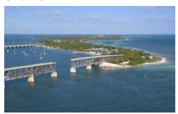
Bahia Honda State Park

(c) After receipt of the state land planning agency report and recommendation, the Administration Commission shall determine whether the requirements have been fulfilled and may remove the designation of the Florida Keys as an area of critical state concern. If the commission removes the designation, it shall initiate rulemaking to repeal any rules relating to such designation within 60 days. If, after receipt of the state land planning agency's report and recommendation, the Commission finds that the requirements for