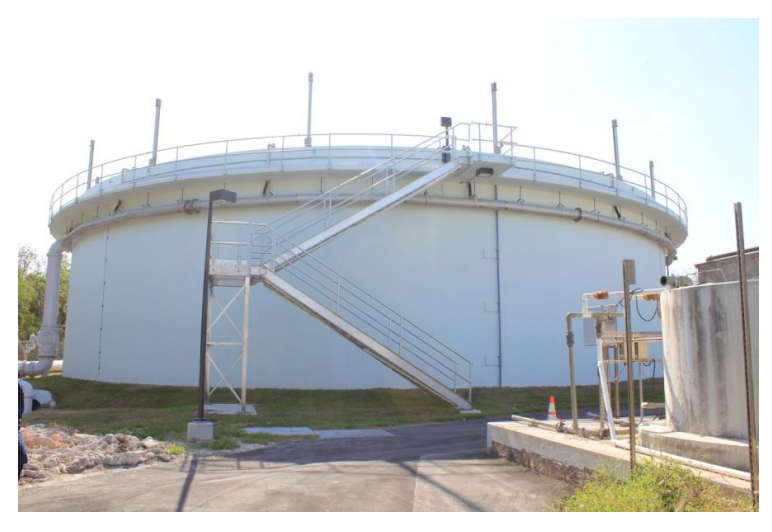
Key Largo Wastewater Treatment Plant

The Monroe County Land Authority purchased 73 Tier I lots and four Tier II lots. Four applications for Administrative Relief were reviewed for applicants that had waited four years to receive a building permit allocation. All four applicants rejected offers for purchase and were awarded building permit allocations. The Monroe County Land Authority applied to the U.S. Army Corps of Engineers for land acquisition grants and received $67,000.