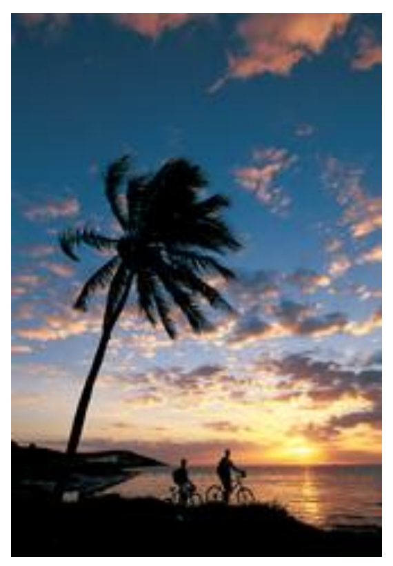
Bikers on Florida Keys Overseas Heritage Trail

Two tasks that were not completed by the County due to funding constraints pertain to the Cudjoe Regional Wastewater Treatment Plant. The design of the inner collection and transmission system and the design of the outer collection and transmission system were not achieved during the evaluation Instead, the County focused efforts on obtaining the approval of bond financing through the Save Our Everglades Program. The Florida Legislature approved $30 million in bond financing in 2012 to facilitate construction of the Cudjoe Facility with a connection fee that is commensurate with that charged countywide. As previously stated, in November, the voters in the County approved a referendum to extend the infrastructure sales tax to further supplement the funding for Cudjoe and other County capital improvements. The County, through its statutory partner, the Florida Keys Aqueduct Authority, has requested bids for the construction of the Cudjoe plant and design of the outer collection