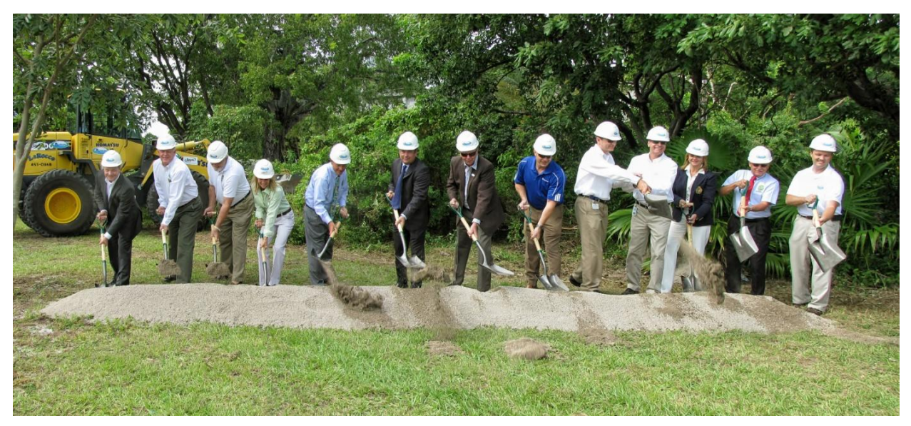
Groundbreaking Ceremony Islamorada Wastewater Project October 2012

The Village of Islamorada completed ten out of ten tasks targeted for completion during 2012 (100%). The primary objective of the Village of Islamorada was to engage a wastewater contractor in sufficient time to meet the September 2012 deadline to utilize bond financing made available by the Legislature in the 2012 Legislative Session. The Village was successful in obtaining the issuance of $20 million in bond financing under the Save Our Everglades Program. The Village entered into a contract with the Key Largo Wastewater Special District to accept,