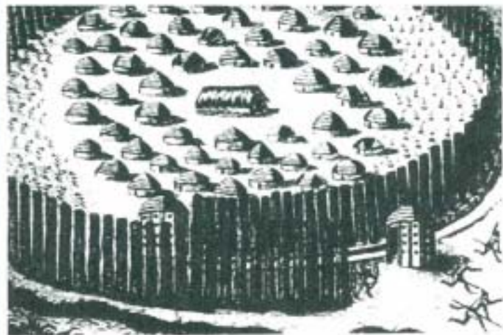
A Timucuan Village sketched by French Artist Jacques Le Moyne.

Mayport's history began with the Timucuan Indians, who had been living in the southeastern United States for over 5,000 years. These Indians were considered to have evolved to a very high level of technological achievement in comparison to other Indian cultures of North America. Their lifestyles was captured by Jacques Le Moyne, an artist who accompanied French Explorer Jean Ribault. When Le Moyne returned to France, he set down a near complete history of these Indians.