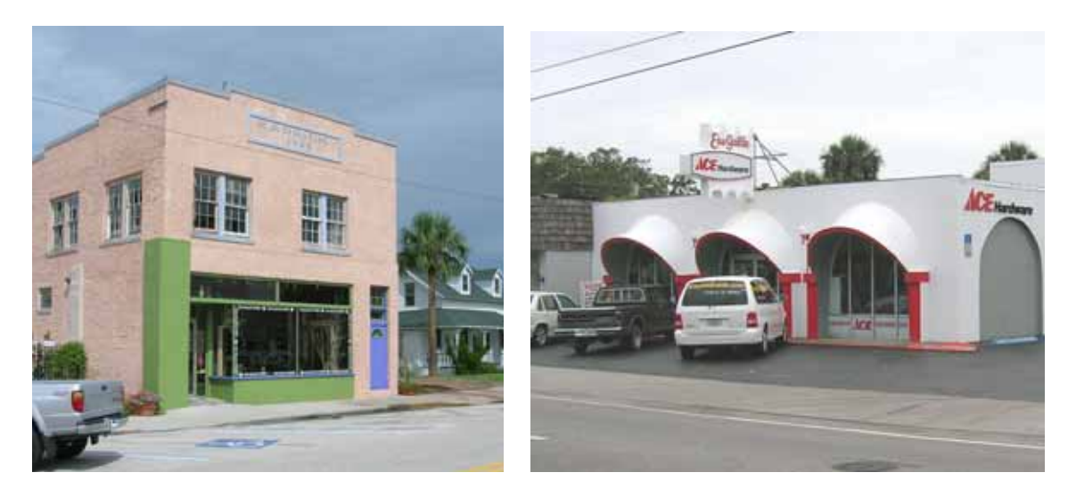
Eau Gallie's commercial buildings cover a wide range of historical periods.