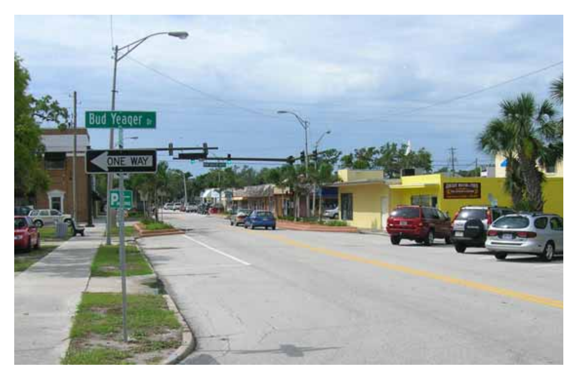
Eau Gallie has a handful of small businesses, art galleries and community buildings that offers an attractive historic shopping village.