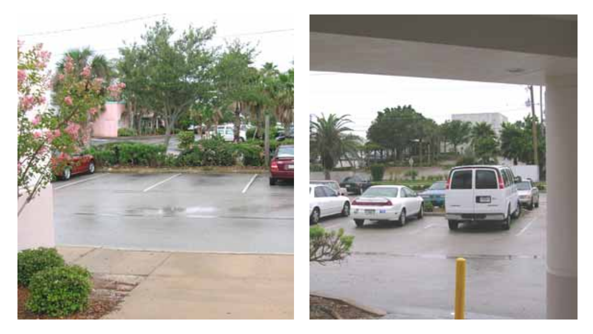
Although the County Library is a major anchor for the Eau Gallie shopping district, existing linkages and views to adjacent buildings are cut-off, limiting cross pedestrian movement and shopping. Photo on the left is a view from the library looking south towards Conchy Joe's Restaurant. Photo on the right is a view from the Library's entry looking west towards the Brevard Museum of Arts and Sciences primary entry.