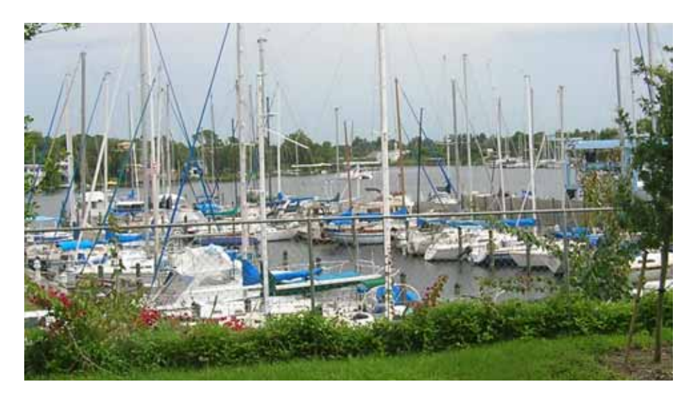
Eau Gallie is a popular boating community with many boat owners driving from as far as Orlando.