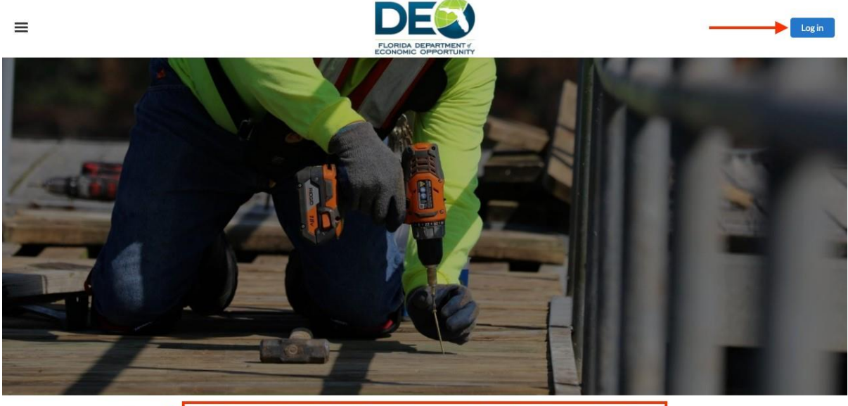
Click here to check Workforce Recovery Training Program Eligibility

Click on the 'Click here to check Workforce Recovery Training Eligibility' link. If you are a returning user, click on the 'Log in' button in the top right corner to log in to your account.