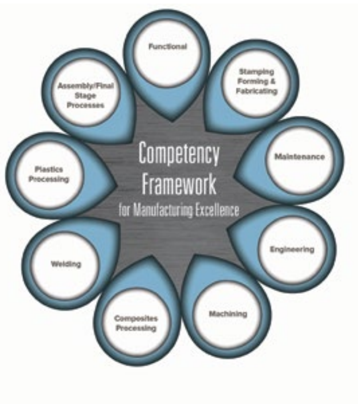
Created by a cross-section of manufacturing experts, Tooling U-SME's Competency Framework is a comprehensive series of competency models in nine manufacturing functional areas.

Designed to complement other competency models in the industry, the Competency Framework can be used "as is" or customized to individual work practices at your facility. Another benefit is that the knowledge objectives within the framework are mapped directly to Tooling U-SME's extensive training resources. All this helps ensure your employees have the knowledge, skills, and abilities they need to be high performers.