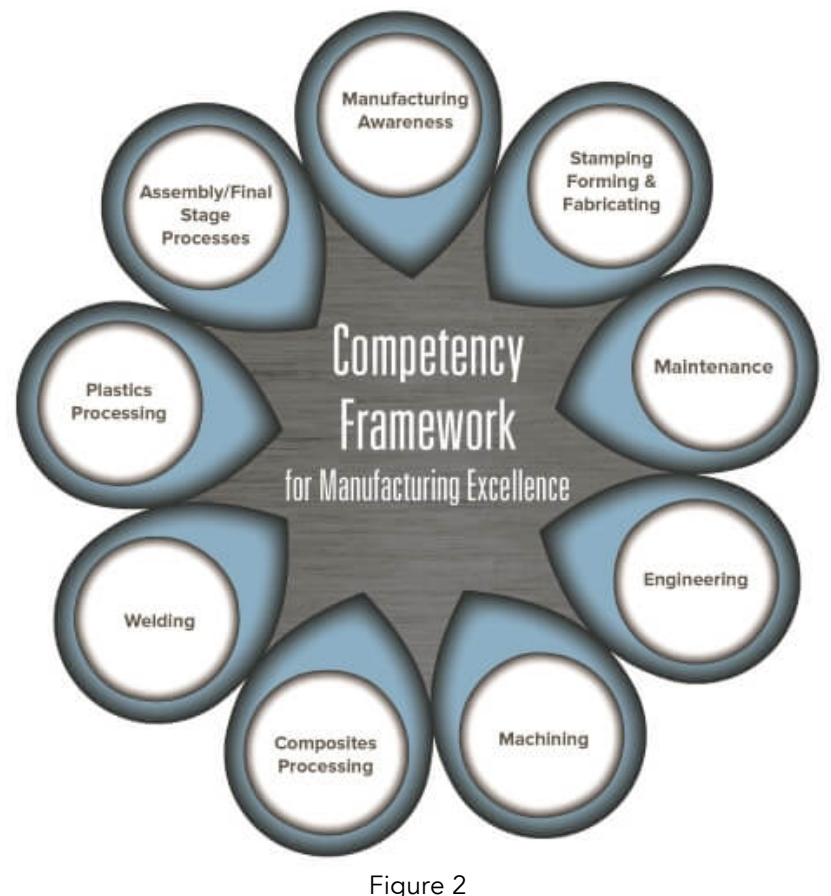
Tooling U Competency Framework

This particularly rings true when considering the diverse range of industries in Florida's manufacturing sector, and the variance and uniqueness in sub-clustering depending on the region within the state. In many regions, both metropolitan and rural, state and local training institutes must invest their scarce resources in training infrastructure, at best, in support of subsectors with the highest concentrations, leaving behind underserved ones where economies of scale do not exist. In a state with as diverse and dispersed a manufacturing industry as Florida, emerging yet less dominant or concentrated industries will need to fend for themselves in terms of available training resources.