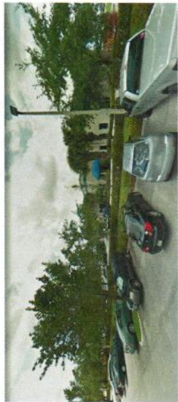
2 PROPOSED PEDESTRIAN PATH