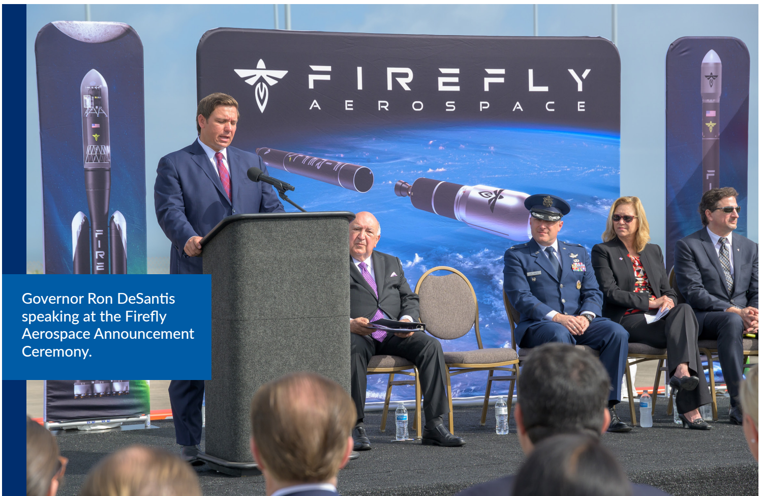
Governor Ron DeSantis speaking at the Firefly Aerospace Announcement Ceremony.

As Florida's spaceport development authority, Space Florida will enable the company's Florida operations by matching the company's infrastructure investments up to $18.9 million via the Florida Department of Transportation Spaceport Improvement Program. Firefly will invest $52 million and will bring more than 200 high paying jobs to Florida.