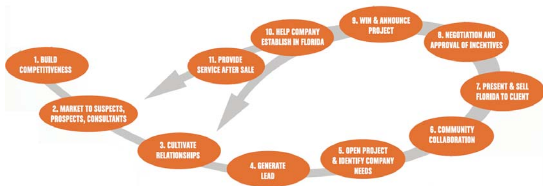
Figure 1. Economic Development Process

Florida’s economic development incentives are components of a toolkit, which is critical to improving Florida’s economy through new job creation. The state’s toolkit includes programs designed to address specific needs of businesses as they look to expand or locate in Florida. Each program serves a different role in attracting businesses and retaining jobs, and the programs come in various forms, including: tax credits, tax refunds, tax exemptions, infrastructure funding, and cash grants paid to a qualified business. In some cases, business needs can be met by making introductions to other companies within an industry cluster, assisting with a permitting issue, or helping to identify a suitable site. These situations are a win-win for the business and state, since limited taxpayer resources are required to facilitate new job creation. However, incentives are often required to “close the deal” on competitive projects, otherwise these high-quality jobs will be established in another state or country.