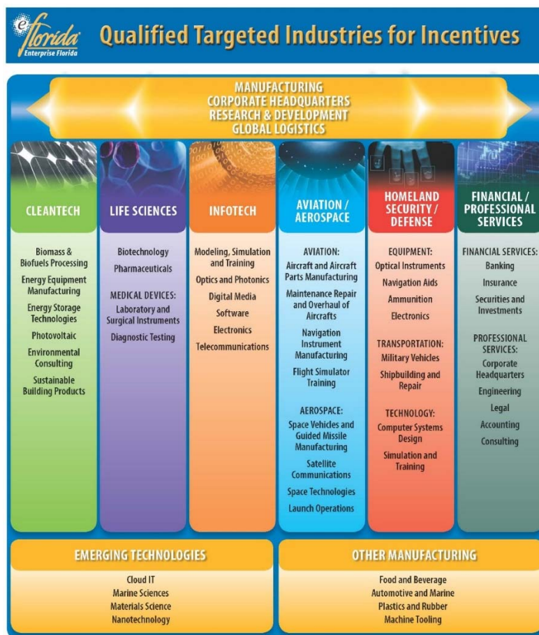
Figure 2. Qualified Targeted Industries for Incentives

Businesses able to locate in other states and serving multi-state and/or international markets are targeted. Call Centers and Shared Service Centers may qualify for incentives if certain economic criteria are met. Retail activities, utilities, mining and other extraction or processing businesses, and activities regulated by the Division of Hotels and Restaurants of the Department of Business and Professional Regulation are statutorily excluded from consideration. All projects are evaluated on an individual basis and therefore operating in a target industry does not automatically indicate eligibility.