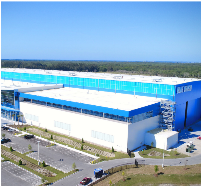
Blue Origin's New Glenn Orbital Launch vehicle program launch, manufacturing and support facility in Florida.

Space Florida's business development opportunities continue to grow the state's commercial space industry and other aerospace-related sectors through various innovation accelerators, financing capabilities and spaceport improvement program activities.