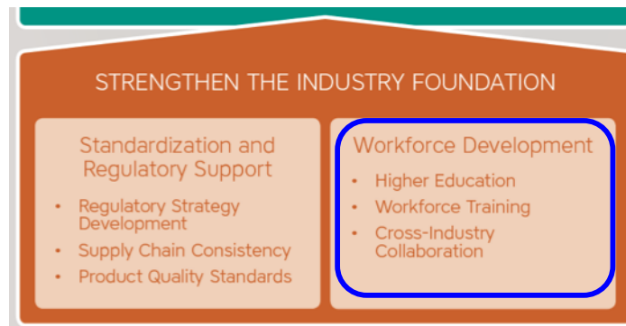
Figure 1: Excerpt from Roadmap Strategy (2).

“Beyond managing the technical aspects of cell processing, storage, and quality control, the cell manufacturing community must also build a workforce and establish standards and regulations that can sustain long-term industry growth. An effective workforce needs to be capable of not only operating, but continuously improving next-generation cell manufacturing technologies and their associated techniques.” (Figure 1).