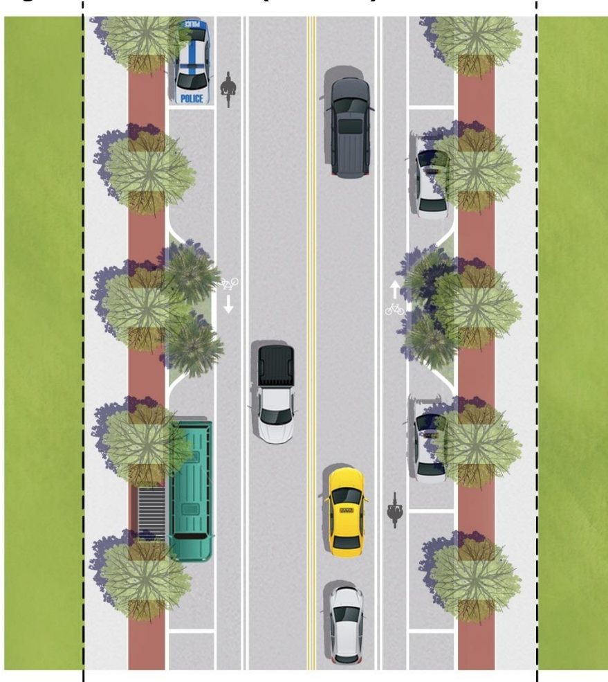
Figure T - 17: AVENUE (80' ROW)