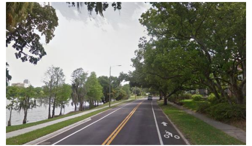
Avenue with bike lanes