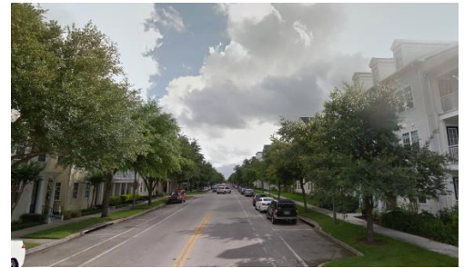
Avenue with on-street parking and bike lanes