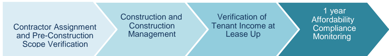
Figure 2: Construction and Compliance

The construction and compliance phase, as shown in Figure 2, is when repair, replacement or reconstruction assistance is provided to the landlord property owner through direct construction activities performed by the program and the result is a market-ready affordable housing unit. After the verification of tenant income and the completion of the affordability period for single family rental units, which is a minimum of one year, the grant will be closed assuming the property owner has remained in compliance throughout the term of the affordability period.